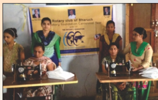
Women Empowerment Project