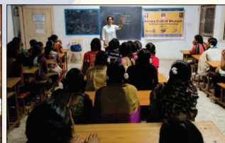
“Hum Honge Kamyab”