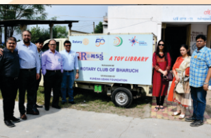
“Romakadu” A Toy Library