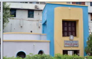
Pay & Use Toilet