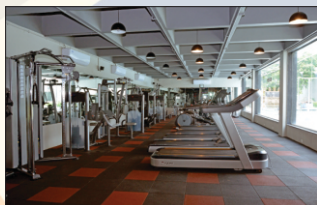
M. I. Patel Rotary Youth Centre