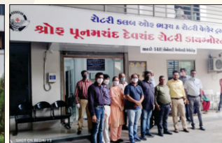
Shroff Poonamchand Devchand Rotary Diagnostic Centre