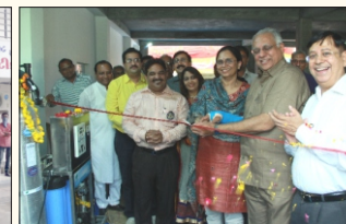
Reverse Osmosis Plant Sustainable Water & Sanitation Project