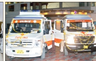
Critical Care Ambulance